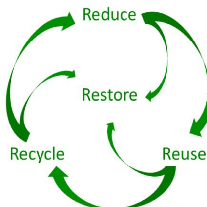
Figure 3; Graphical depiction of the reduce, reuse, recycle motto in combination with a reinvestment strategy into a restore component. The short arrows correspond to a part of the financial savings obtained from conservation or efficiency efforts that is rein-

The work presented in this paper suggests that in addition to estimating environmental impact, it is important to estimate financial savings obtained from sustainability efforts. Expanding the motto "reduce, reuse, recycle" to "reduce, reuse, recycle and restore" captures this shift in emphasis. A graphical depiction of the restore concept is shown in Figure 3 . This depiction shows that for many sustainability efforts, a fraction of the realized financial savings can be used to contribute to the restore component or other Rs of sustainability.