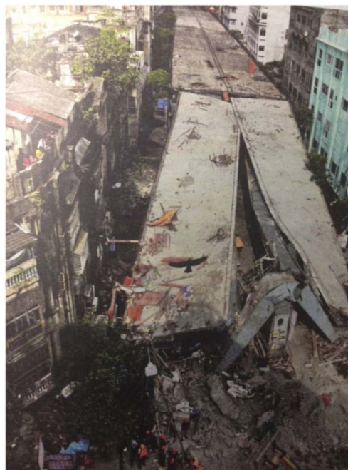
Figure 1. The overpass in Kolkata that collapsed in April 2016. The fact that such a road solution (through the old walking city fabric) could be considered in 2016 shows that the Modernist approach to infrastructure is still alive and well.

The Functional City and its Manuals of Modernism spread across the world like wildfire. Universities began teaching traffic engineering and town planning with all of its pseudoscience. Town Planning legislation enabled the processes to be made legal and the professionals who produced the numbers were treated like the doctors of city growth.